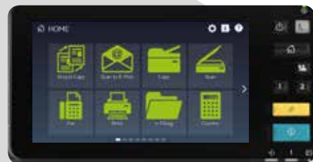
Display icons as buttons to easily access functions or start workflows.