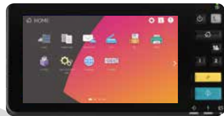
Customised to display up to 18 icons per page and with a different background

Mobile Printing connects these systems with your mobile devices via AirPrint, Google Cloud Print or the Mopria Print Service.